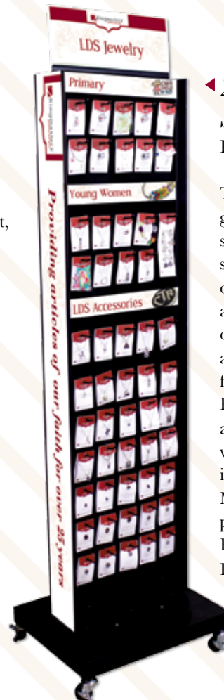
◀ 2-sided Floor Spinner Display KDD090

Both saving floor space and maximizing your display impact, the new slat wall display, may be the perfect option for your store. This 44" tall pegboard display hangs from standard slat wall and can hold up to 36 carded Ringmasters products. Minimum wholesale product purchase of $300.00 13.75" w x 4.5" d x 44" h