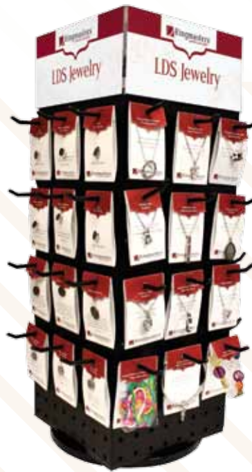
◀ 4-sided counter display KDD092

2-sided pegboard display that holds up to 15 items per side (30 total). Minimum wholesale product purchase of $100.00 Base: 8" w x 2" d x 20" h