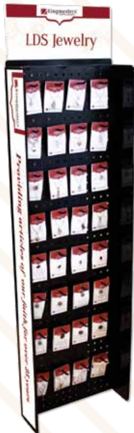
◀ Slat Wall Display KDD093

4-sided pegboard display that holds up to 15 items per side (60 total). Minimum wholesale product purchase of $440.00 Base: 8" w x 8" d (9 inches of clearance required for swing radius), 20" h