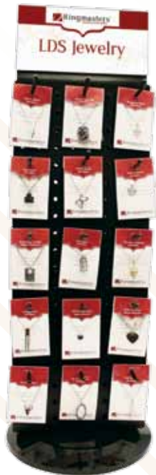
◀ 2-sided counter display KDD096

2-sided pegboard display that holds up to 15 items per side (30 total). Minimum wholesale product purchase of $100.00 Base: 8" w x 2" d x 20" h